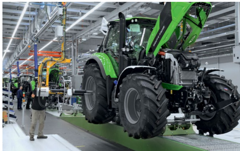
↑ High-tech designed in Germany.