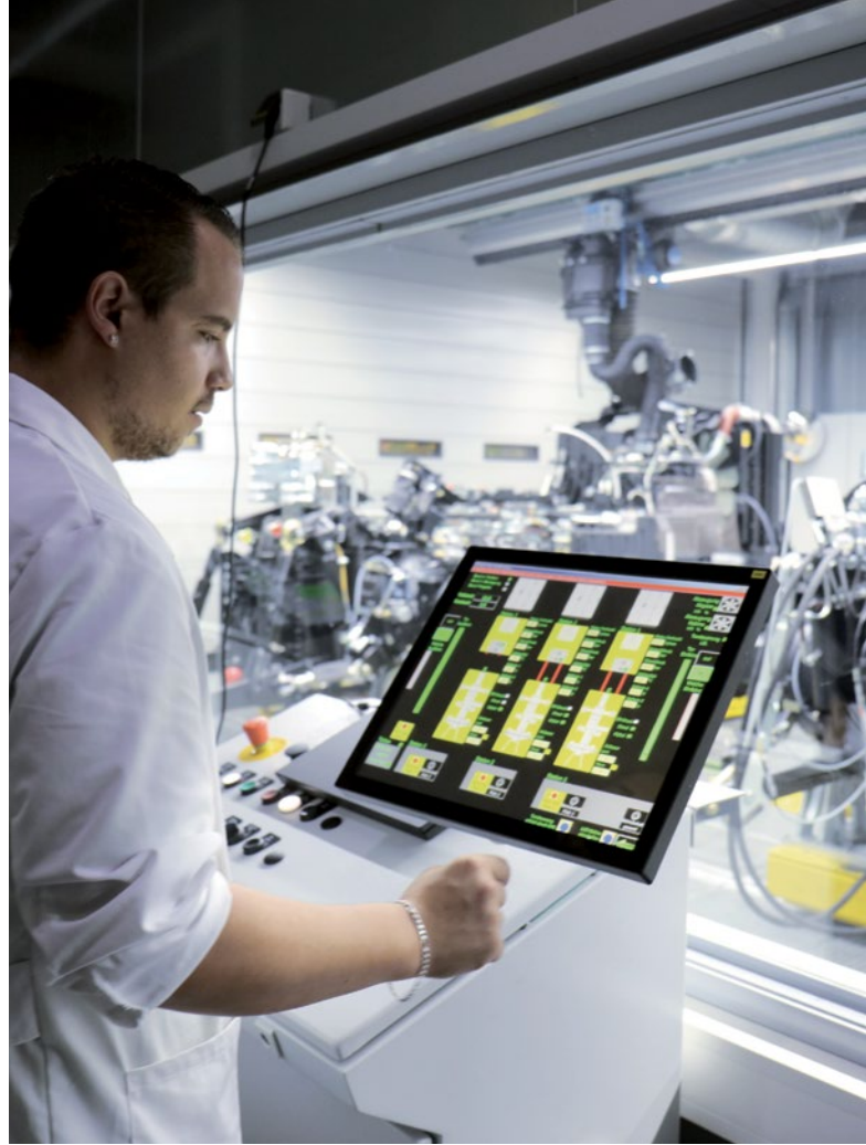
↑ We set new standards in production quality.